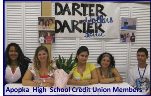
Apopka High School Credit Union Members